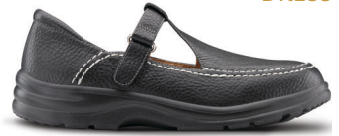
LuLu Black 4610 P