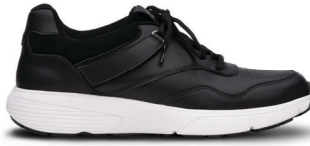
Peter Black 51610