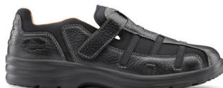
Betty Black 3810