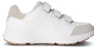
Angela White 11840