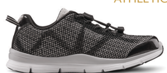
Jason Black 77710