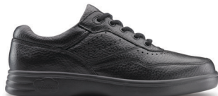
Patty Black 1010