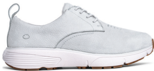
Ruth Grey 10580