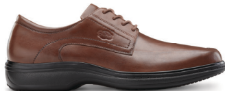
Classic Chestnut 8420