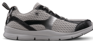
Chris Grey 77880