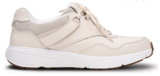
Theresa Beige 11730