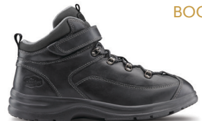
Vigor Black 2510