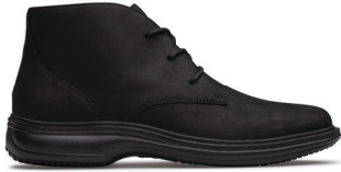
Ruk Black 7910