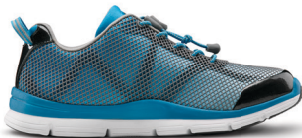
Katy Turquoise 37750