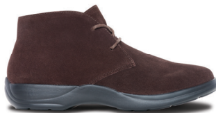
Cara Brown 38020