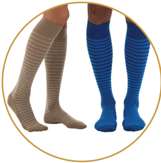
EASY STREET STRIPE