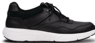
Theresa Black 11710