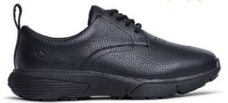
Ruth Black 10510