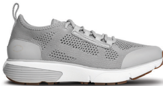
Diane Grey 10680