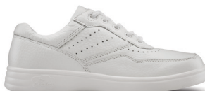
Patty White 1040