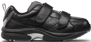
Winner X Black 7710