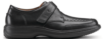
Frank Black 6210