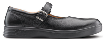
Merry Jane Black 4410