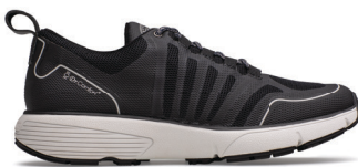
Gordon Black 10110