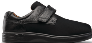
Annie X Black 4910