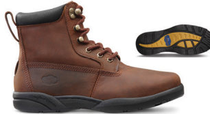
Boss Chestnut 9520