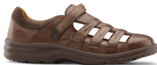
Breeze Coffee 0820