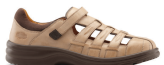
Breeze Light Gold 0830