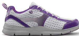
Meghan Purple 37855