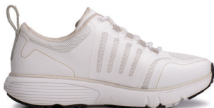
Grace Grey 10380