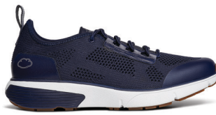
Jack Blue 51050