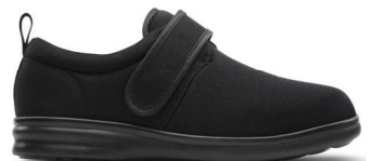
Marla Black 0910