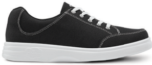
Riley Midnight 0250