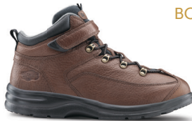
Vigor Chestnut 2520