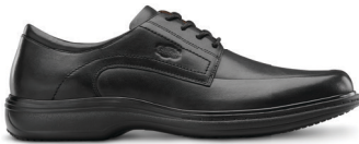
Classic Black 8410