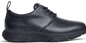
Roger Midnight 10411