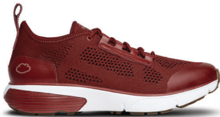
Diane Red 10670