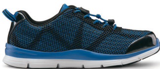
Jason Blue 77750