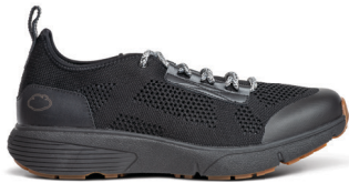
Jack Black 51010