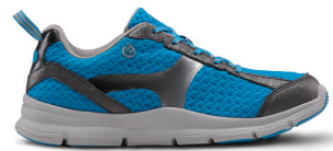
Meghan Turquoise 37850