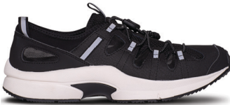
Polo Black 51810R