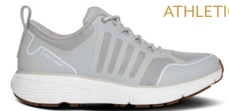
Gordon Grey 10180