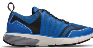
Gordon Blue 10150