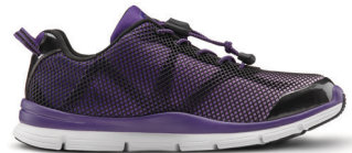
Katy Purple, 37755