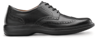
Wing Black 8310