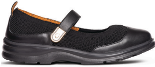
Jackie Black 10710