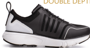
Grace X Black 11310