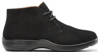
Cara Black 38010