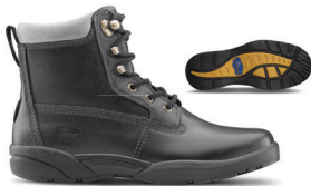
Boss Black 9510