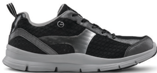
Chris Black 77810