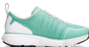
Grace Seafoam 10325