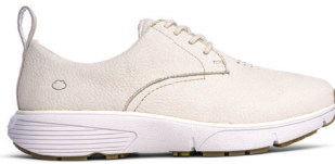
Ruth Nude 10530