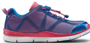
Katy Pink/Turquoise 37770