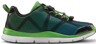
Katy Green/Turquoise 37725