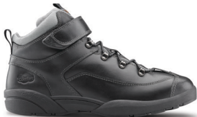
Ranger Black 9410 P