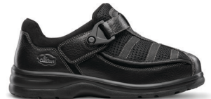
Lucie X Black 2610