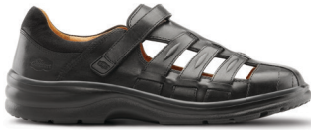
Breeze Black 0810