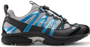
Performance Metallic Blue 7650 P