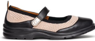
Jackie Nude 10730