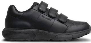
Angela Black 11810