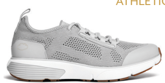
Jack Grey 51080